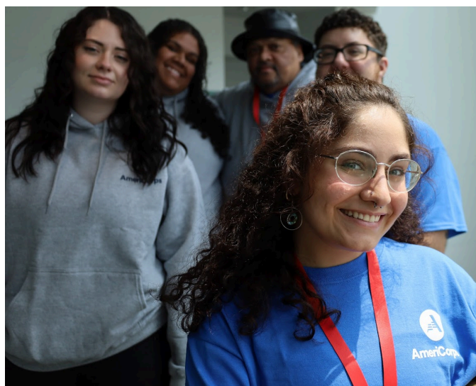
AmeriCorps service members from Summer 2023